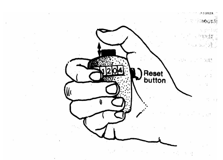
Figure 3: Tally counter used for accurately counting waterbird flocks.

These devices can be extremely useful, especially at sites with large numbers of birds. Each click of the button advances the count on the display by one unit. Experienced observers may use one, two or more tally counters to enhance the speed and accuracy of their counts (See "How to count in "blocks" on page 10 below for details.)