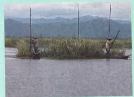
Fishing in Phumdis