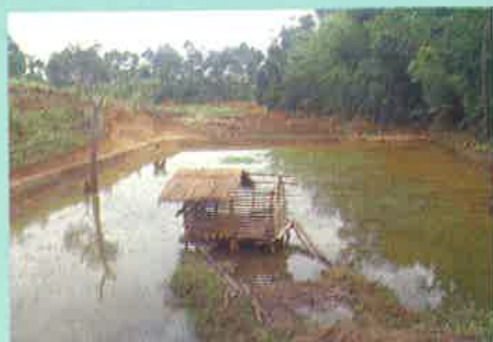
Piggery cum pisciculture in Sadar Joute

A demonstration project on integration of piggery with pisciculture is under implementation in Sadar Joute and Bungte Chiru, two hill villages of the Loktak catchment. The project is being implemented by the Village Authority,