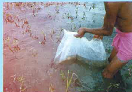
Release of fingerlings in paddy field

The project is implemented through the Gram Panchayats and the youth clubs, who identify the beneficiaries. The project operated through an MoU signed between the beneficiary and the project, under which the beneficiary provide an equal number of fingerlings provided to him to another beneficiary identified jointly by the LDA, Gram Panchayat and the Youth Clubs.