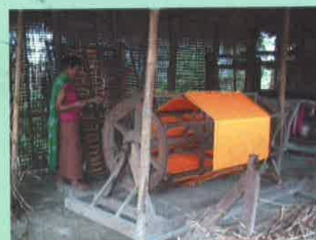
Handloom in Sadar Joute

A demonstration project on additional income generation handloom and