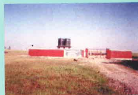
Fish Hatchery at Toubul

developmental works. The construction of this hatchery was completed in July 2001 and a successful trial run was done in August 2001. The hatchery shall be handed over to the Toubul Welfare Committee shortly.