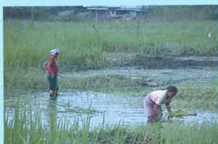
Vegitable collection from Phumdis

Traditionally, phumdis were managed by common community effort. Every year, a common schedule was worked out wherein all the communities were involved in deepening of the channels, and cutting and sending the phumdis down through the Khordak channel. Southerly winds aided the flow towards the Khordak channel. The channels were desilted annually. In the lean seasons when the phumdis went dry, they were burnt.