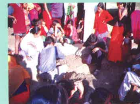
Training on construction of smokeless chullah

Training and workshops have been organized under the project to enhance