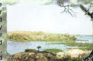
Harike Wetland, Punjab

The study on 'Economic valuation of Harike Lake, Punjab was completed in November 2001 and the final project report was submitted to Ramsar Convention Bureau. The study highlights the role of Harike wetland in water purification, sediment retention, flood mitigation, ground water recharge, maintenance of biodiversity habitats and provision of economically important species as fishes and reeds. Valuation methods as Market pricing, Opportunity Cost, Surrogate pricing, Contingent Ranking and Contingent Valuation were used to arrive at the Economic Value of wetland benefits. A cost benefit analysis has been done to assess the resource use efficiency, based on which a framework for resource development and management has been developed.