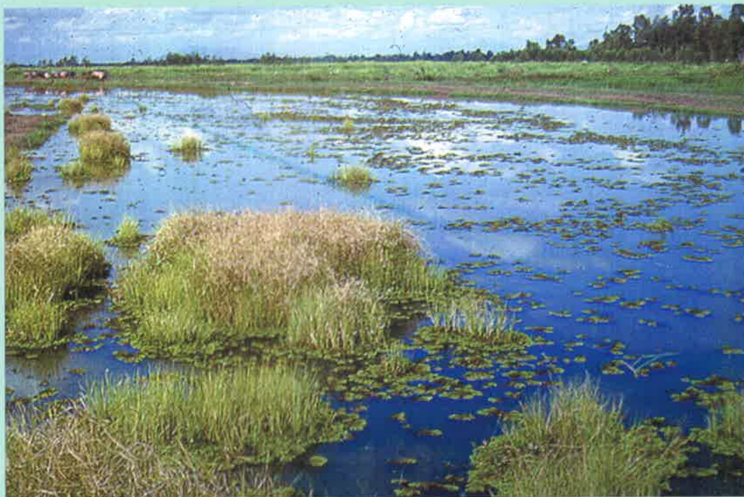
Phumdis in Loktak Lake

I certainly hope that my bibliography, when it is complete, will both interest and benefit those who manage, study, and live near Loktak Lake, and whose lives influence and are influenced by its floating islands. I would be grateful to learn of any historical descriptions of the floating islands in Loktak Lake or elsewhere in India.