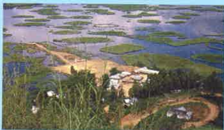
Phumdis in Loktak Lake

Loktak Lake, the largest freshwater wetland in northeastern region of India, plays an important role in the ecological and economic security of the region. A large population living in and around the lake depends upon the lake resources for its sustenance. People of Manipur are culturally, socially and economically linked with the Loktak and hence the lake has been referred to as a lifeline of Manipur.