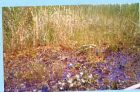
Primary Stages of Phumdis Formation

Studies on genesis and proliferation of phumdis have been initiated under the project. Phumdis have been found to form naturally as well as artificially. Salvania and Cyperus have been