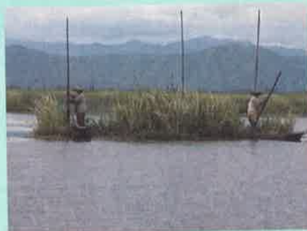
Fishing in Phumdis