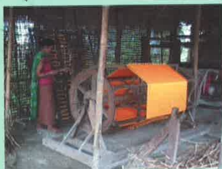
Handloom in Sadar Joute

A demonstration project on additional income generation handloom and