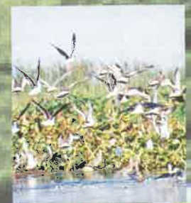
Birds of Chilika Lagoon

A workshop on Restoration of Chilika Lagoon is being jointly organized by Wetlands International South Asia and Chilika Development Authority (CDA) from 18-20 January 2002 at Bhubaneswar, Orissa. The main objective of the workshop was to develop strategies for review the progress of the work carried out by CDA on Chilika Lagoon and discuss the future strategies for its restoration. Several leading scientific organizations at national level, state level, NGO's and community groups have been invited to participate in the workshop for providing inputs into conservation and management of the lagoon.