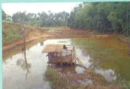
Piggery cum pisciculture in Sadar Joute

A demonstration project on integration of piggery with pisciculture is under implementation in Sadar Joute and Bungte Chiru, two hill villages of the Loktak catchment. The project is being implemented by the Village Authority,