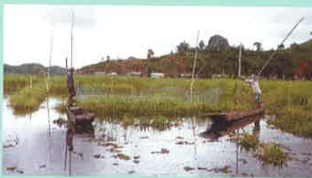
Fishing in Phumdis

The proliferation of phumdis in Loktak Lake after the construction of Ithai barrage has seriously effected the changes in diversity and overall fish productivity of the lake. While the migratory species have been seriously affected by construction of the dam, the decline in fish yield is attributed to several factors.