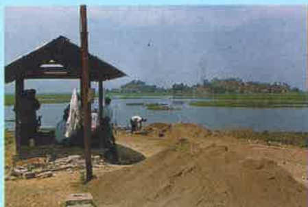
Construction of Lowcost Sanitation Unit in Karang

A low cost sanitation programme to control leaching of human waste and nutrients is being implemented in three island villages of Loktak lake i.e., Karang, Ithing and Takmu, under which low cost community toilets are being constructed with community assistance. The project is being implemented by two community groups, Karang Sanitation Committee, and Ithing Welfare Committee. These groups comprise of members of village panchayats, local NGOs and volunteers for project planning and monitoring. As per the MoU signed between the community representatives and LDA representatives, the community is