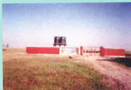
Fish Hatchery at Toubul

developmental works. The construction of this hatchery was completed in July 2001 and a successful trial run was done in August 2001. The hatchery shall be handed over to the Toubul Welfare Committee shortly.