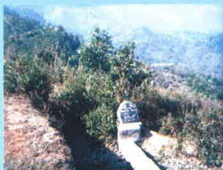
Foundation Stone in Indigenous Irrigation Project, Tingkai Khunou

An Indigenous Irrigation Project was implemented at Tingkai Khunou, a hill village in Khujairok micro watershed of Senapati District. The project involved augmentation of the water availability of the terrace fields by construction of a new irrigation canal, with community involvement. Project was initiated in January 2001 with beginning of the excavation work by the villagers.