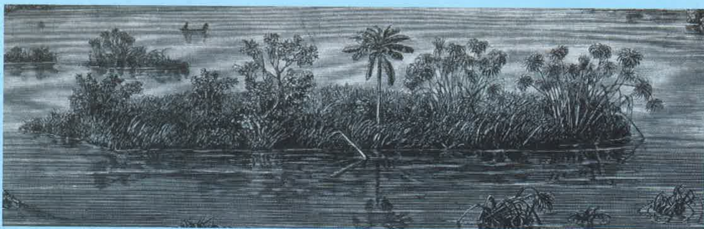
"Detail of a Woodcut Illustration of the Floating Islands in the Congo River by A. Goering, 1883 (from the author's collection)"

Problems with floating islands are common in new reservoirs, where aquatic weeds may grow quickly to form huge and ungainly floating bulks, and in addition, masses of peat submerged at the bottom of the reservoir may rise to the surface of the water to become floating islands. Floating islands can cause health problems by providing breeding grounds for malarial mosquitoes, as in Lake Victoria in Africa, and Gatun Lake, Panama; they may interfere with the operation of ports, as happens in Kisumu, Kenya, on Lake Victoria, and also in Montevideo, Uruguay; and indeed they may threaten