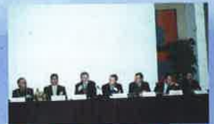
Wetlands International - BOM Meeting